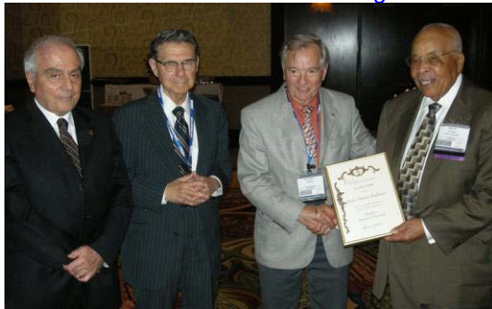
Triennial Meeting of IAQ: ASQ World Conference on Quality and Improvement Houston, Texas

Academicians that attended this conference and Triennial meeting included: