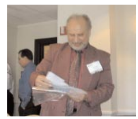
NEW ACN LAPIDUS