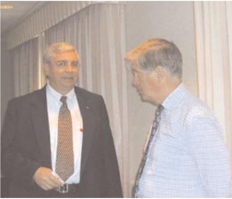
NEW ACN KING WITH ACN SANDHOLM