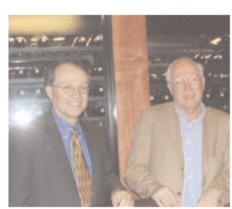
ACN CASE AND ACN SAVARD